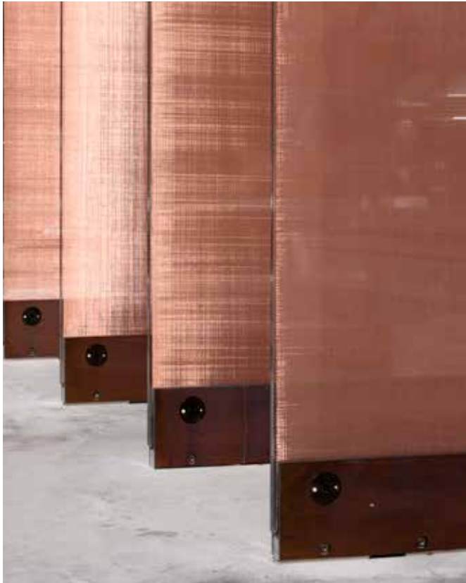
Each of the forms consist of a series of unframed glass panels, measuring 3600 x 1200 mm (141.73 x 47.24 inch), with translucent, single-sided metal coated fabric insets embedded in laminated glass with a SentryGlas® interlayer.

and visitors to the event make use of the London Design Festival to discover the latest trends in design, materials, and processes.