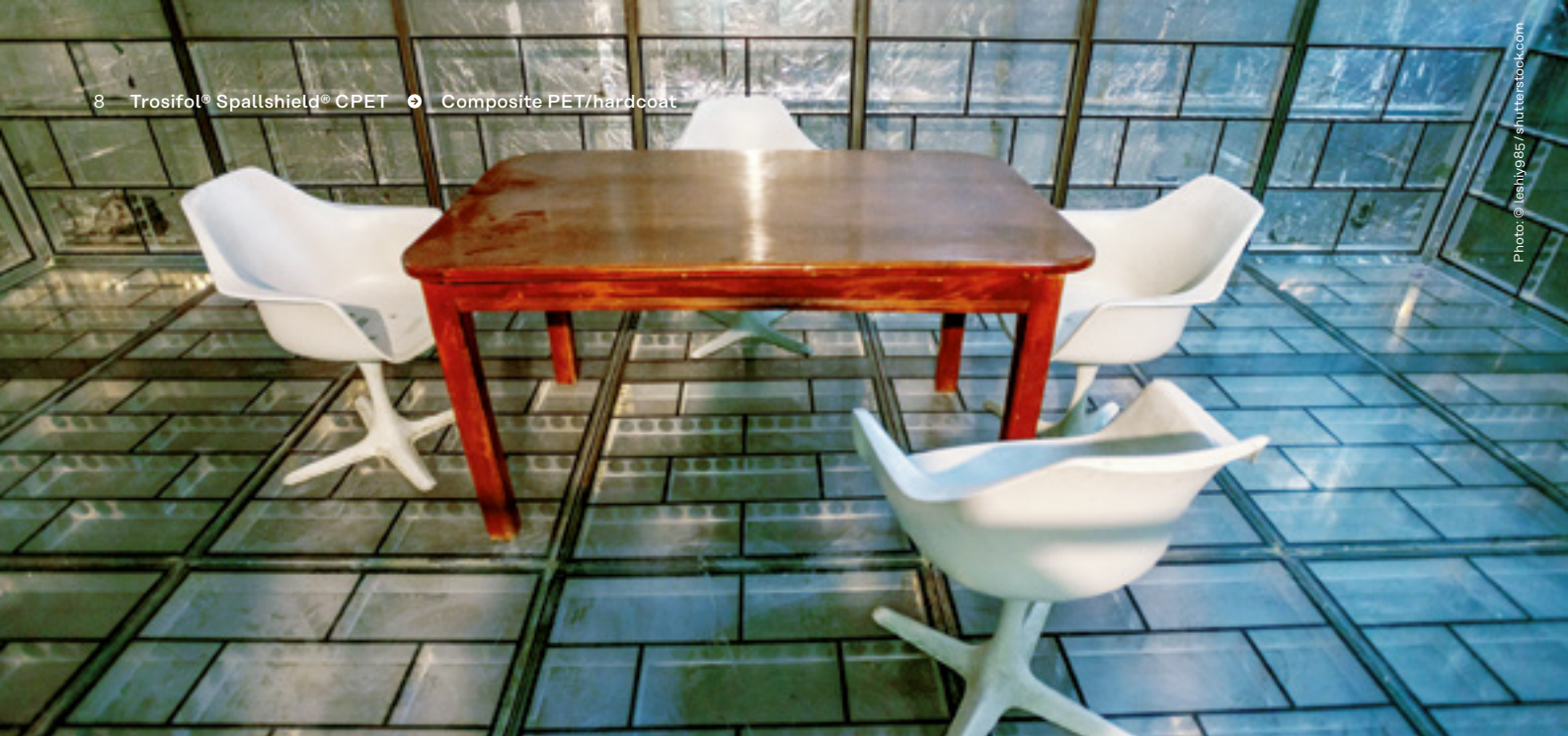
• Glass room in former US Embassy